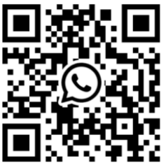
Whats app - Course Advisor