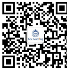
Wechat - Course Advisor